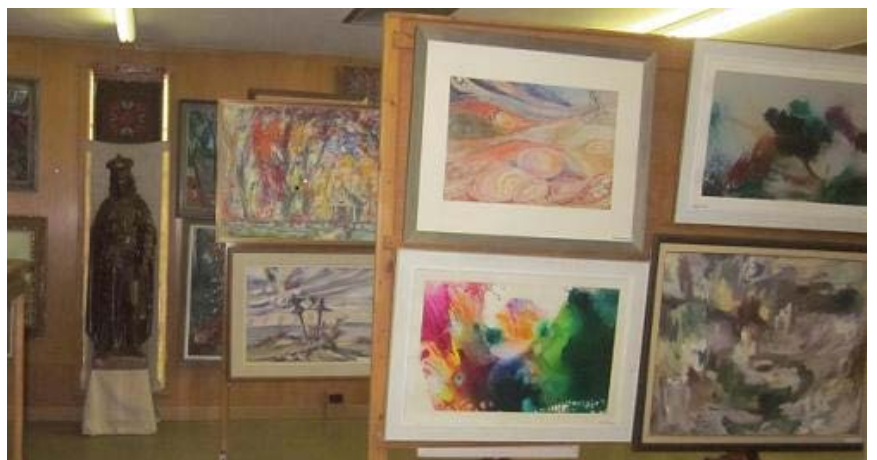
A small part of the ALKA museum collection.

You may view these and other photos at: www.lkma.org